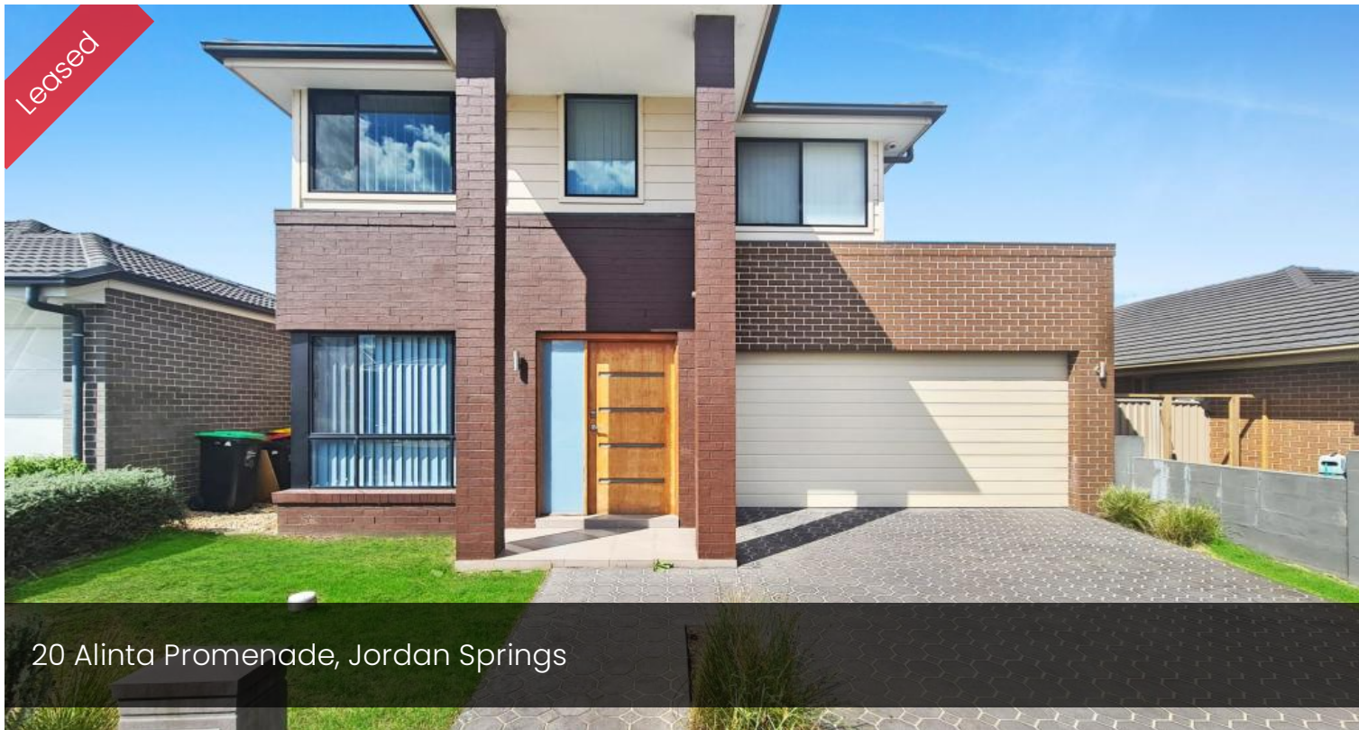
20 Alinta Promenade, Jordan Springs