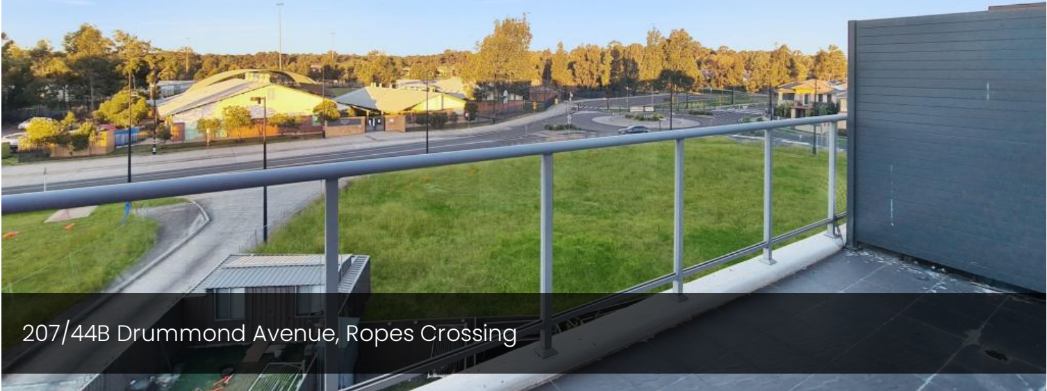
207/44B Drummond Avenue, Ropes Crossing