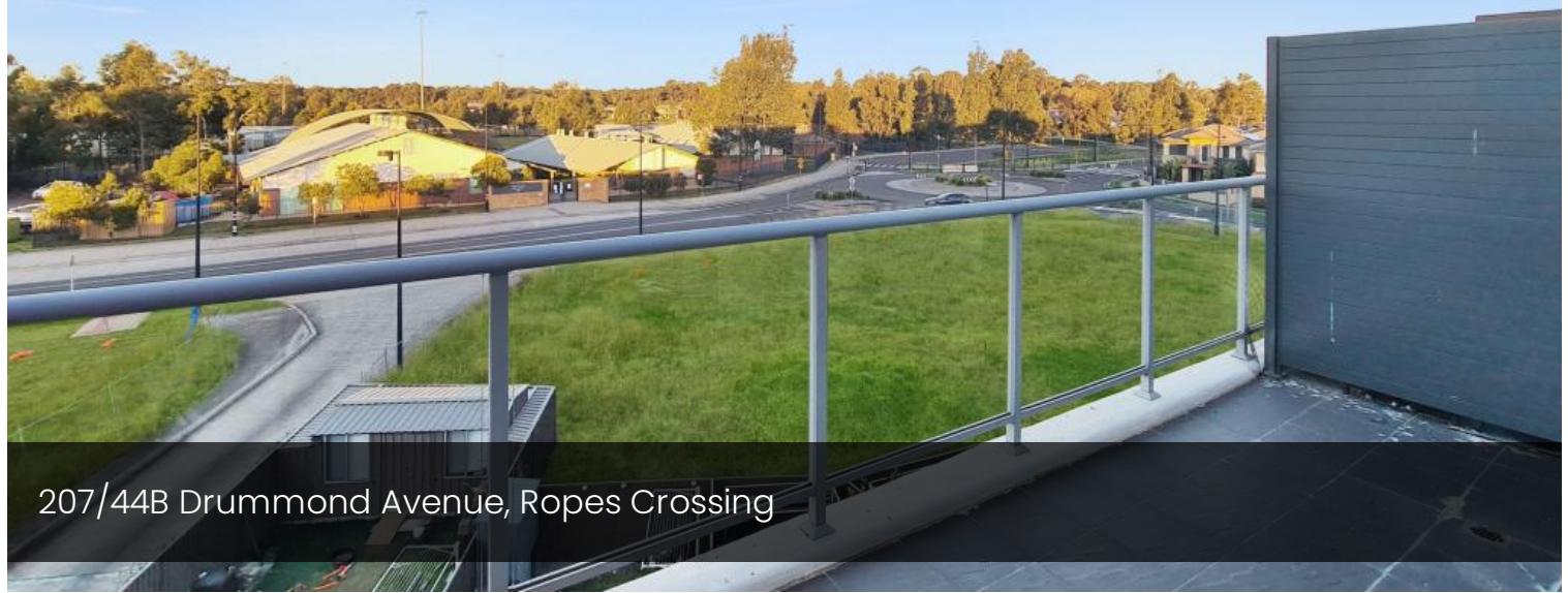
207/44B Drummond Avenue, Ropes Crossing