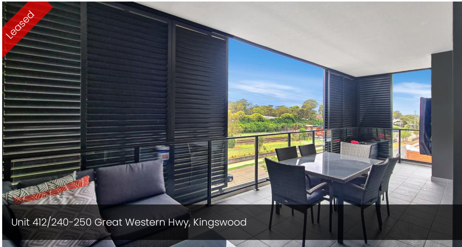
Unit 412/240-250 Great Western Hwy, Kingswood