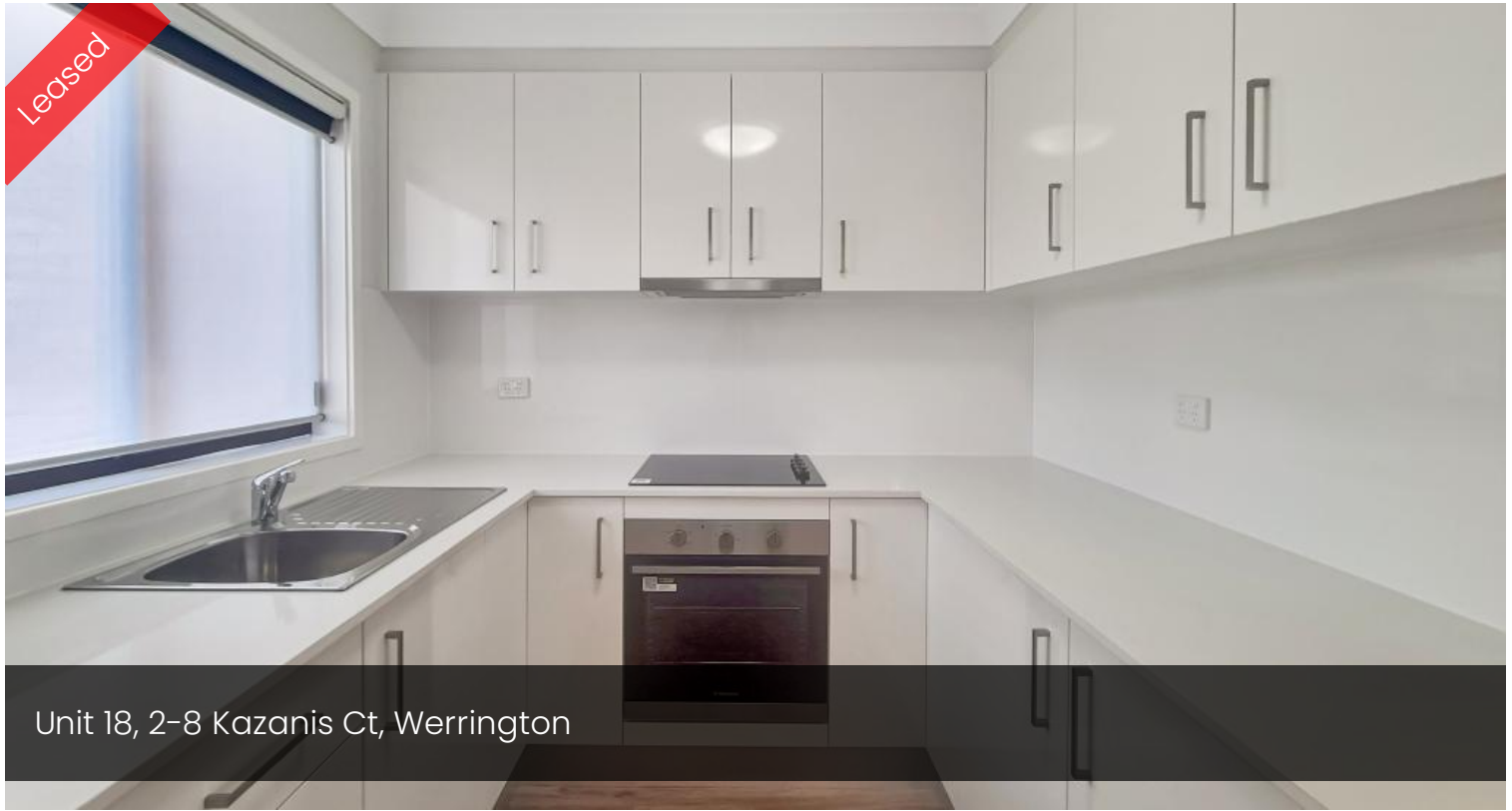
Unit 18, 2-8 Kazanis Ct, Werrington